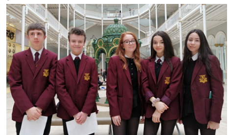
OUR ART AND DESIGN PUPILS ENJOYING THE NATIONAL MUSEUM OF SCOTLAND

S3 pupils and staff travelled to Edinburgh on the 15th of March for their annual museum trip. Art and Design pupils and staff enjoyed their day at the National Museum of Scotland. They explored the vast collection, which includes prehistoric dinosaur bones and exhibits on space exploration and ancient Egypt. This experience forms the research part of their design projects and pupils took plenty of photos to kick-start their studies.