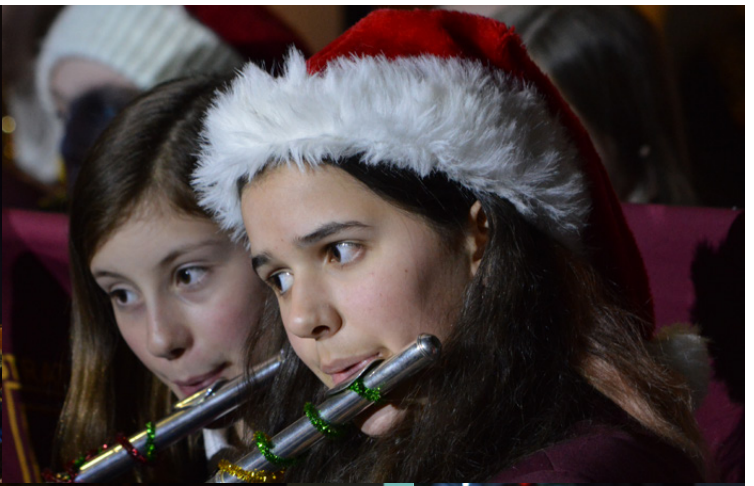
(FROM PAGE 1)