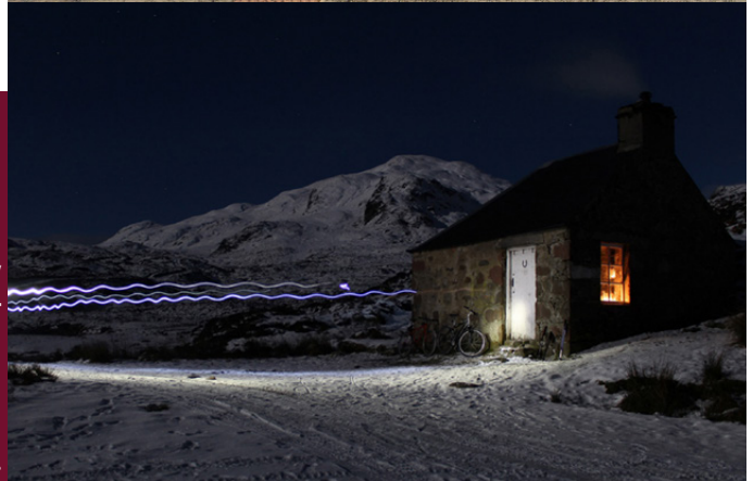
WINNING SHOT (ABOVE) RETURN FROM THE HILL, LAIRIG LEACHACH AND (BELOW) AT THE CEREMONY WITH RAY MEARS

Strathaven Academy is holding a brand new photography competition open to all year groups. The theme is 'A Different Perspective' and all participants are asked to submit a standard postcard-sized print (6x4 inches) to the Art and Design department staff by the 28th of February. We will pick the twelve photos that we think best fit the brief, and enlist the public to judge them at the Creative and Aesthetic Showcase in March. A winner will be announced on the night of the event. The shortlist of twelve will also be put forward for the local Rotary Photography Competition. We hope that you support this competition and we look forward to seeing your outstanding photographs. Good luck!